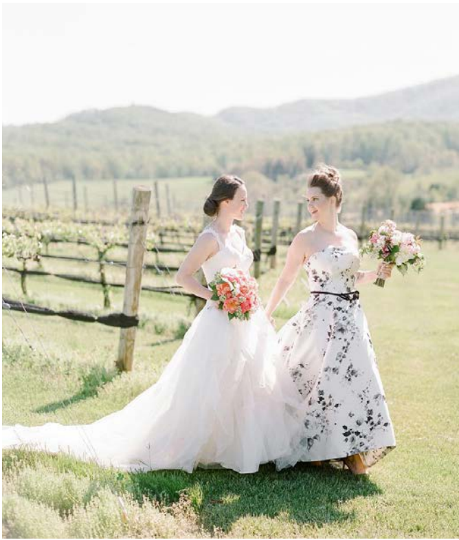
SPRING WEDDINGS PAGE 13