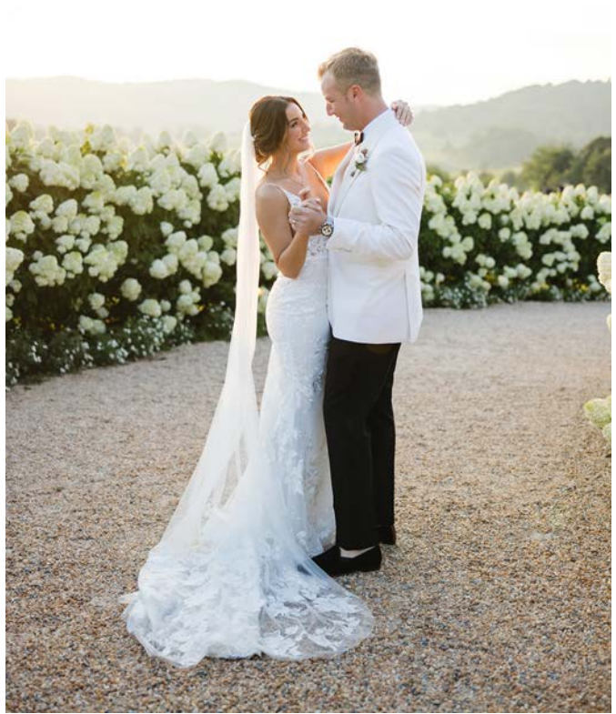
SUMMER WEDDINGS PAGE 17