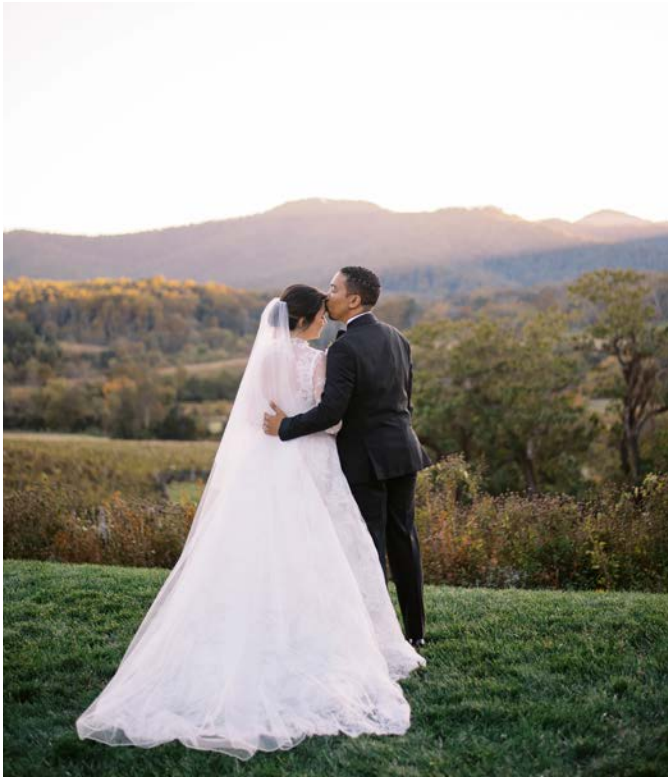
FALL WEDDINGS PAGE 21