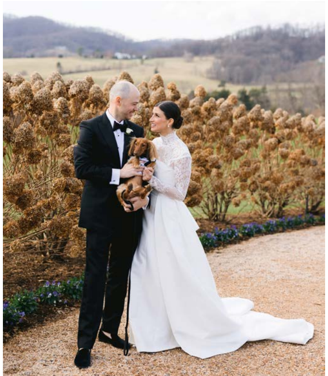
WINTER WEDDINGS PAGE 25