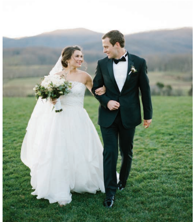
WINTER WEDDINGS PAGE 25