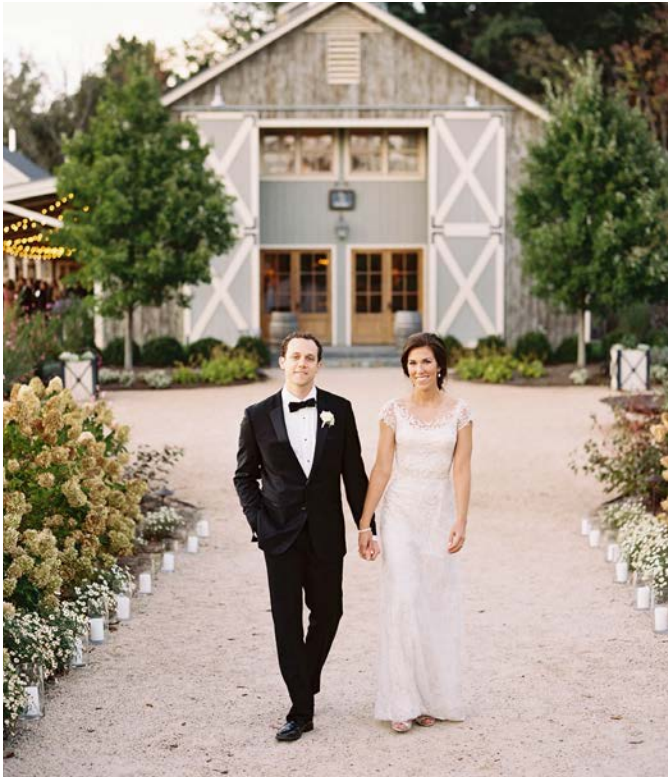
FALL WEDDINGS PAGE 21