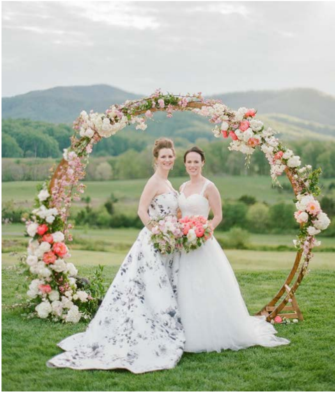
SPRING WEDDINGS PAGE 13